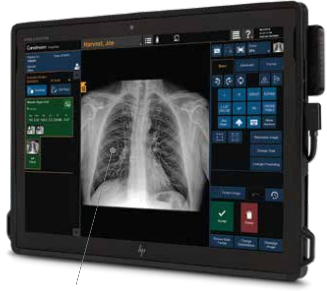
The DRX-Transportable System/Lite features wireless tablet operation. There's no bulky electronics box required, and no need to work from a fixed console – you can move freely around the exam room. A DR Detector and battery charger complete the system.

Bottom line? You can make a quick transition to DR at any time – with no fear of technology obsolescence. Plus, you'll enjoy the confidence of knowing your system will have a long, usable life well into the future.